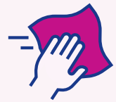
Sanitizing Spray & Disposable Towels

To the extent federal, state, or local agencies recommend the use of additional PPE, NAEP will ensure that representatives are provided with the same.